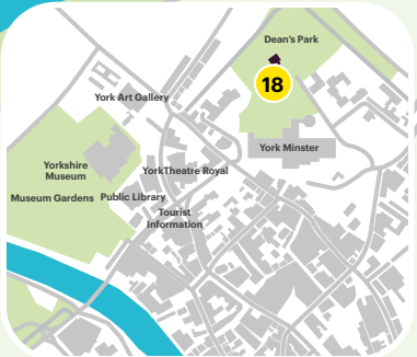
York city centre